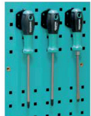
Perforated side panels