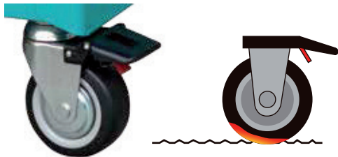
5x2" Oil resistant TPR high-performance roller bearing casters